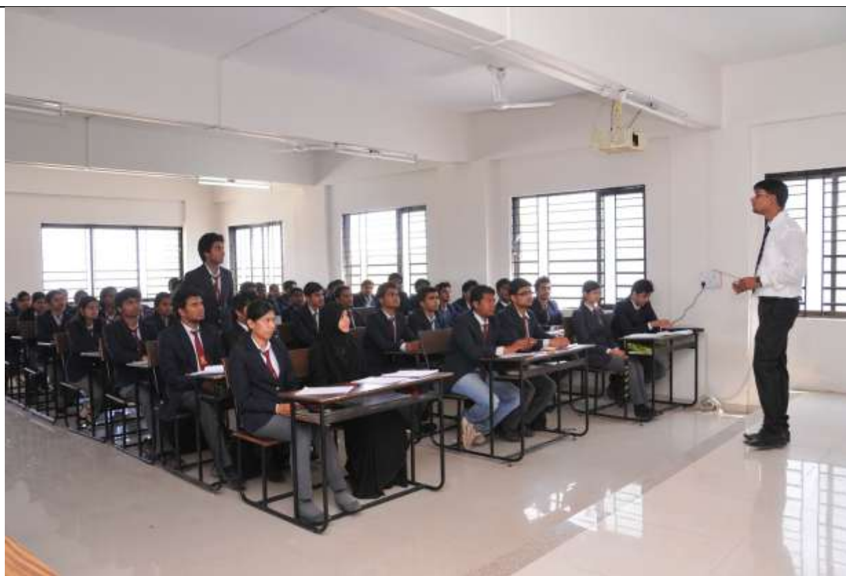
Class Room with Projector