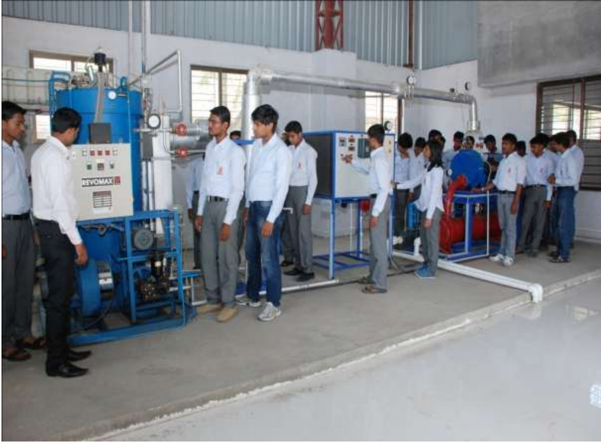
Steam Power Plant