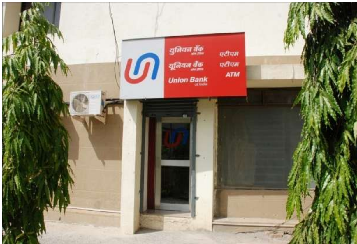
UBI ATM Facility