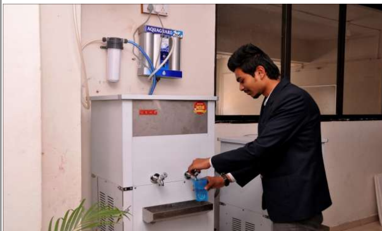
Purifier Drinking Water