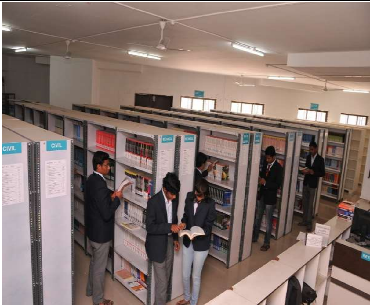
Library Reading Hall